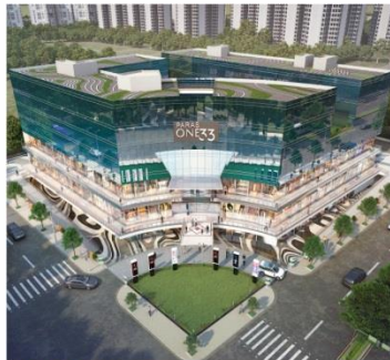
PARAS ONE33 On going