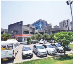
PARAS TRADE CENTRE Delivered