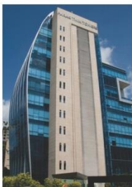
PARAS TWIN TOWERS Delivered